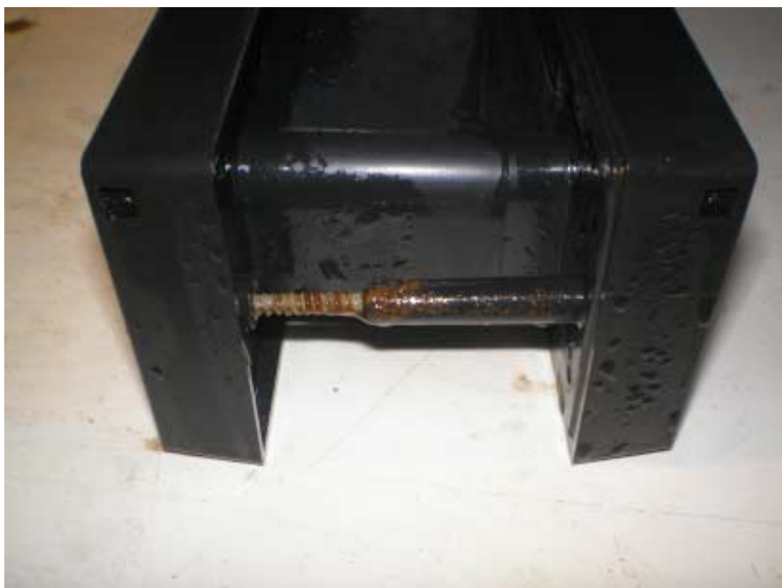
Corrosion of Type A Fixing