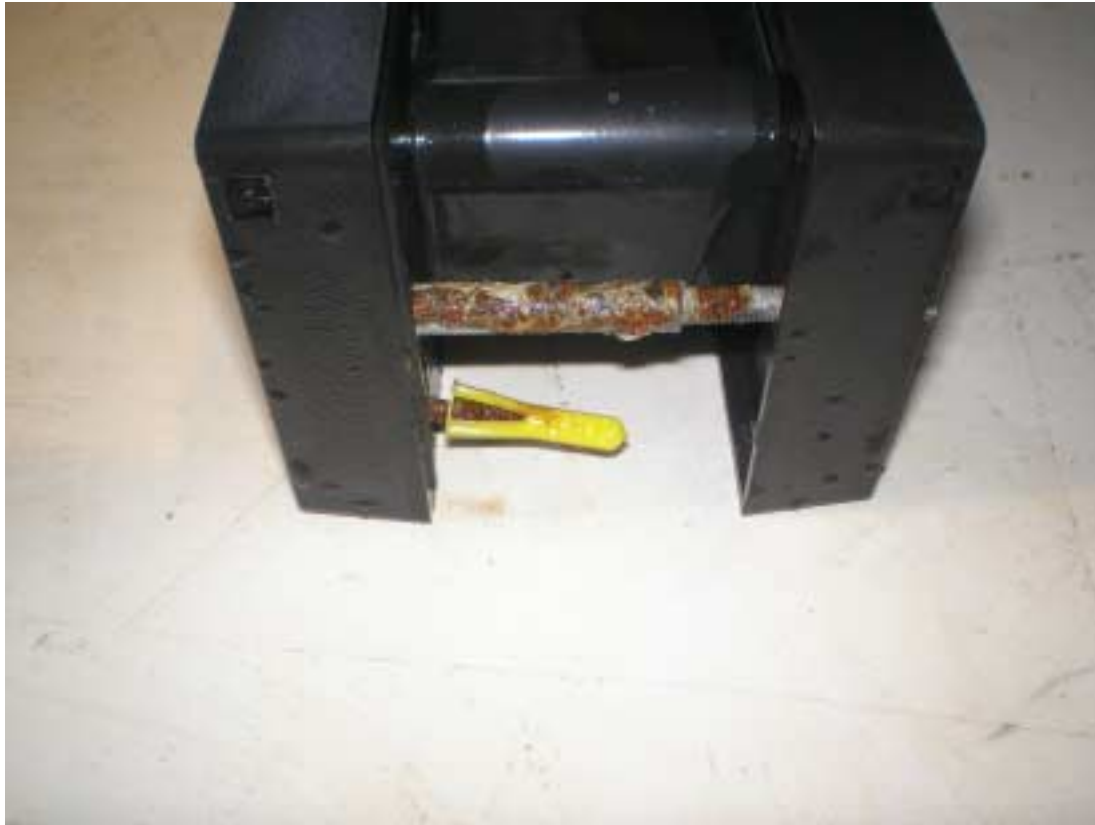
Corrosion of Type B Fixing