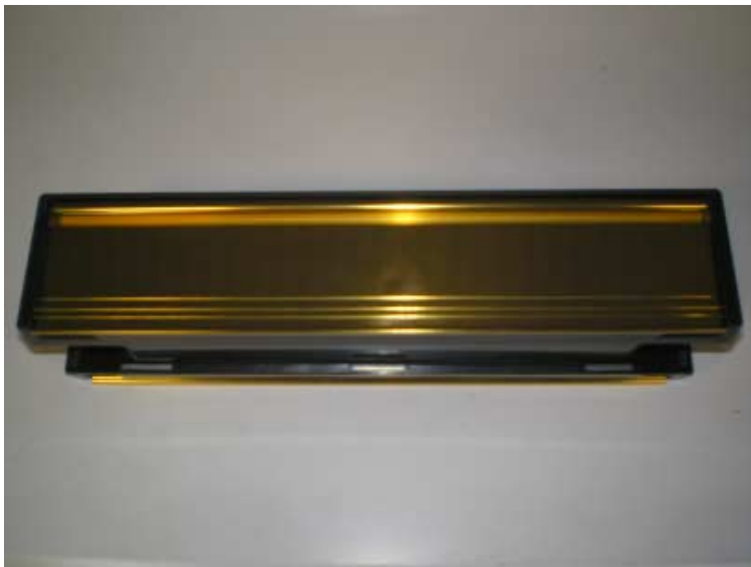
UAP Framemaster Letter Plate (Gold)