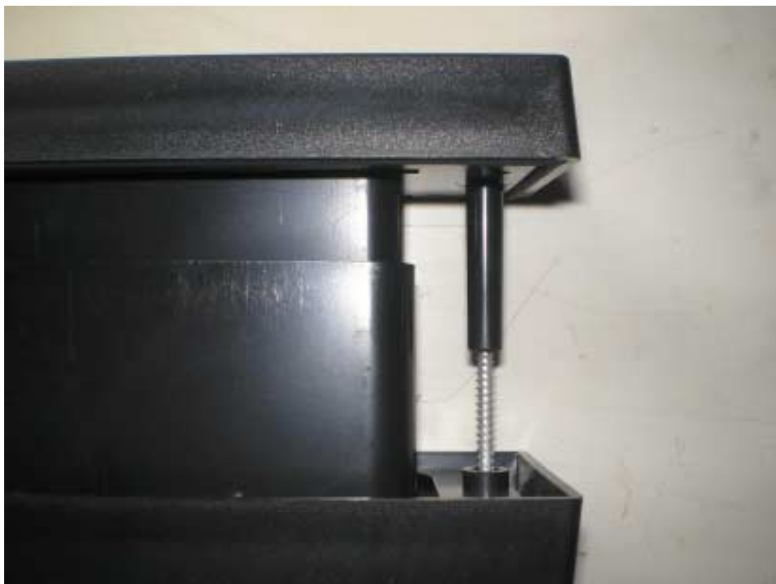
Type A Fixing